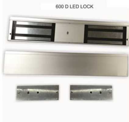
600 D LED LOCK

SEK-VENUS-1200-D-TIMER LED WITH FEEFBACK -12VDC SEK-VENUS-1200-D-TIMER LED WITH FEEFBACK -12VDC/ 24 VDC