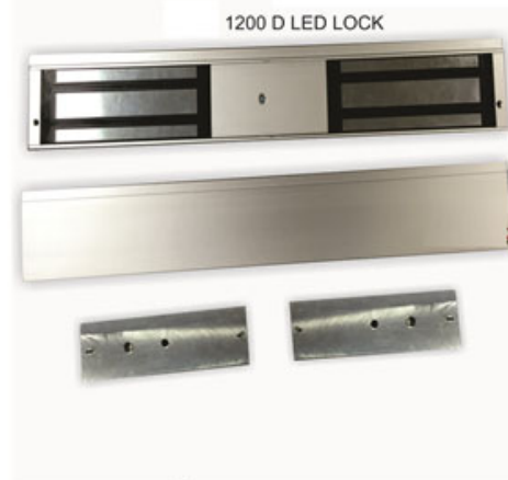
1200 D LED LOCK