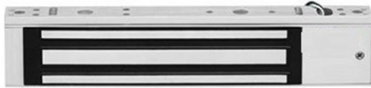
Sek-Venus-Timer -600 lbs Em Lock