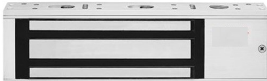
Sek-Venus-Timer -1200 lbs Em Lock